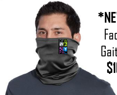
*NEW* Face Gaiter $16