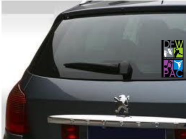
PAC Logo Car Decal/Sticker With Name $15.00