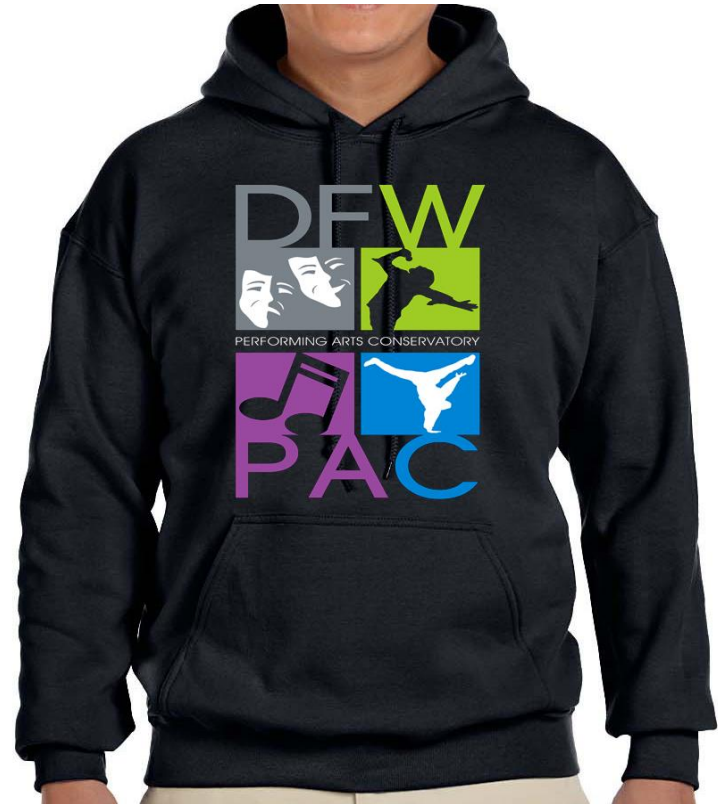
BLACK PULLOVER HOODIE