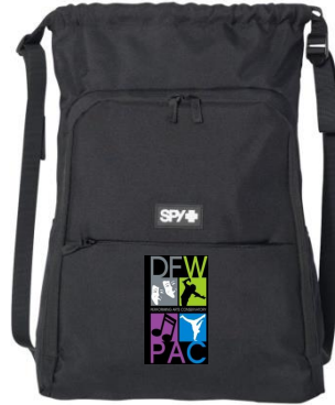
*NEW* Laptop Bag $40.00