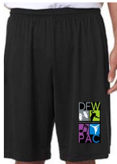
9" Shorts $28

DEADLINE TO ORDER Friday, August 24 th !!!