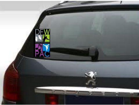
PAC Logo Car Decal/Sticker With Name $15.00