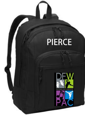
Backpack DFW PAC Logo & Name $58.00