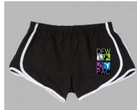
Wind Shorts $38