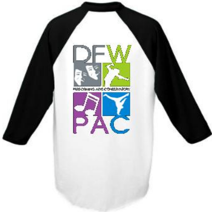
RAGLAN T-SHIRT \frac{3}{4} Sleeve